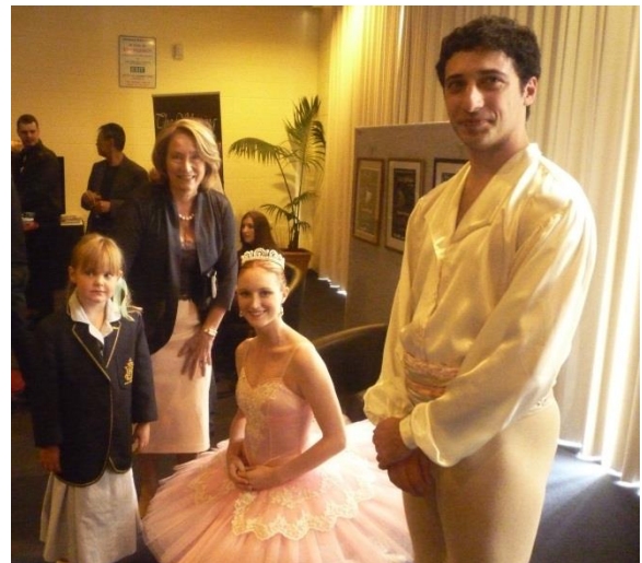
Tasmanian Classical Ballet Company Dancers