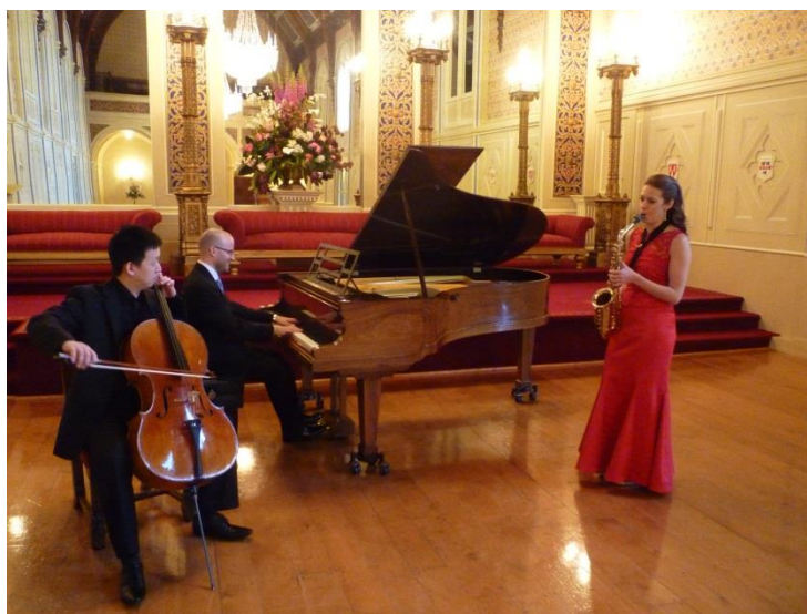
Royal Over-Seas League Competition Winners