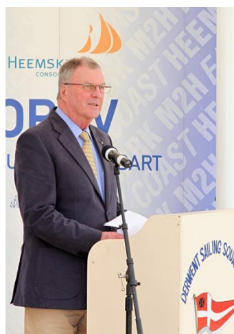
Yacht Race Presentations

The Governor delivered speeches to open local, national and international conferences and meetings and he also gave numerous Diamond Jubilee addresses. His Excellency writes his own speeches and in the year 2011–2012 he wrote and delivered 103 addresses.