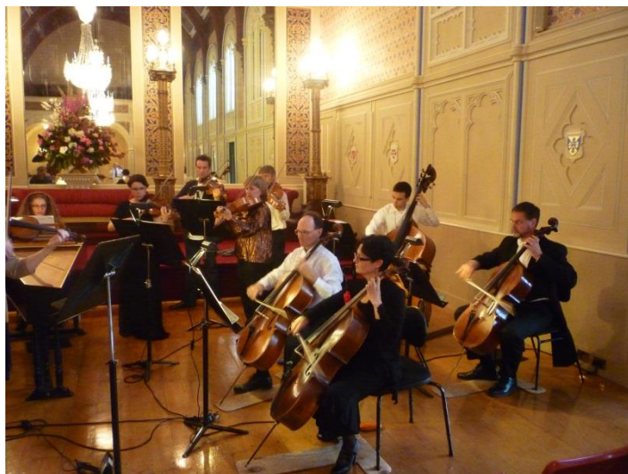
TSO Orchestra members performing at the CCAMLR Concert