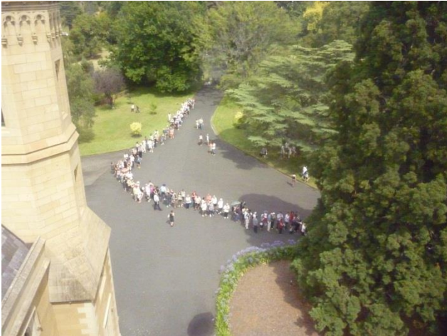
Visitors queuing on Open Day

In the grounds of Government House visitors were able to enjoy food and refreshments sold by the Rotary Club of Howrah and the CWA, while enjoying the sounds of the Australian Army Band Tasmania, the TSO Chorus, Tasmania Police Pipe Band and the Hobart City Wind Band. Red Cross, St John Ambulance and Surf Life Saving Tasmania were on hand throughout the day.