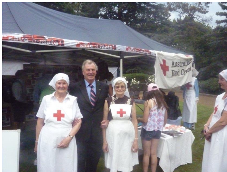
His Excellency and ladies from the Red Cross Marquee