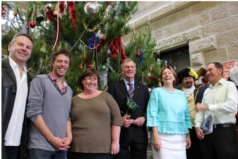
ABC Giving Tree Launch 2011

The Governor also traditionally officiates at commemorative services including: Anzac Day; Armistice Day; Australian Peacekeepers' Day; the Battle of Britain; the Battle of the Coral Sea; the Battle of Crete; the Mariners Service; the dedication Service for the Annual Field of Remembrance; Remembrance Day; Tasmania Police Remembrance Day; Vietnam Veterans' Day.