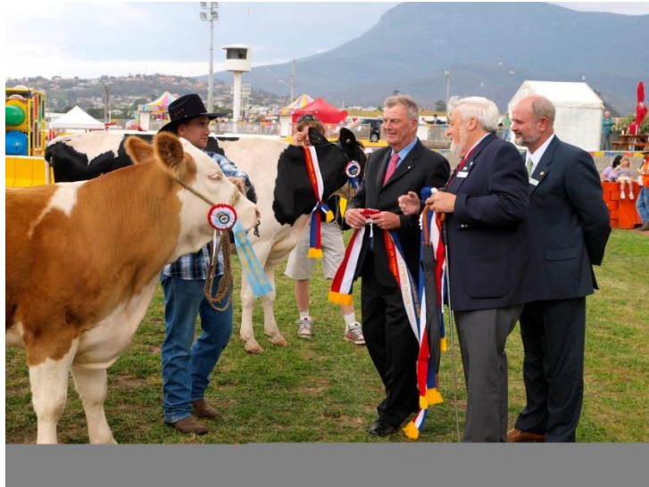
The Royal Hobart Show 2011

Many community events are recurring and attended by the Governor, some of which are: the Hobart Show and the Launceston Show; the Hobart Cup and the Launceston Cup; the Combined Clubs Opening Day; Town and Gown parades in Hobart and Launceston; The Sydney-Hobart yacht race; National Meals on Wheels Day; the Local Government Association of Tasmania Conference.