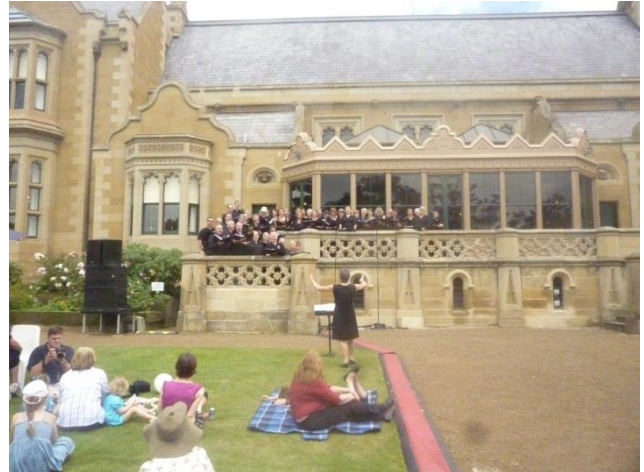
TSO Chorus performing