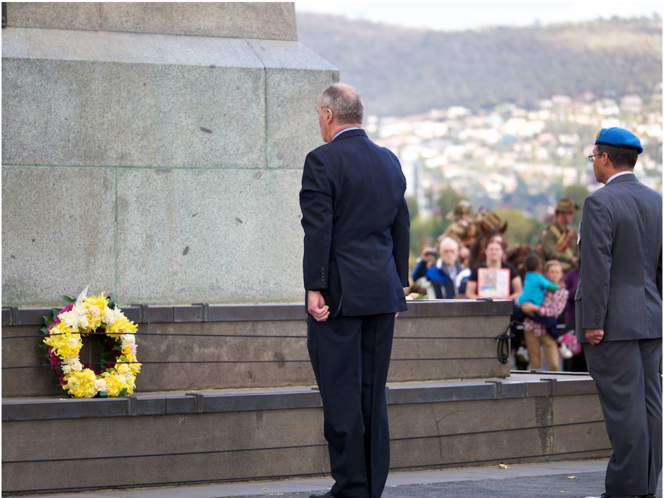
Anzac Day Commemorative Service, Hobart Cenotaph, 25 April 2013. His Excellency traditionally lays the first of many wreaths marking the anniversary of the initial major military action fought by Australian and New Zealand forces in the First World war