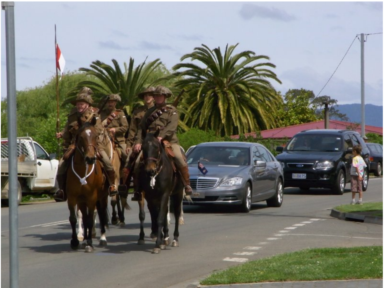
The Vice-Regal vehicle escorted during celebrations to mark the centenary of the Palais Theatre, Franklin, 3 November 2012

Many community events are recurring and attended by the Governor, some of which are: the Royal Hobart Show and the Royal Launceston Show; the Hobart Cup and the Launceston Cup; the Combined Clubs Opening Day; Town and Gown parades in Hobart and Launceston; The Sydney-Hobart yacht race; National Meals on Wheels Day; Scouts and Guides Tasmania AGM; Legacy Luncheons; Australian Institute of Company Directors annual Gold Medal Luncheon.