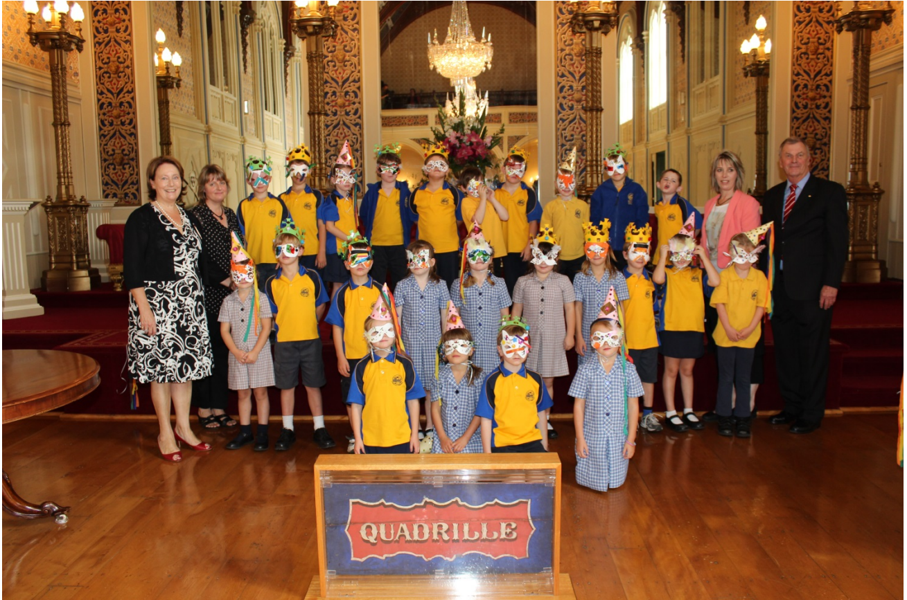
Dunalley Primary School Grade 1 / 2 students enjoyed a visit to Government House, 12 March 2013