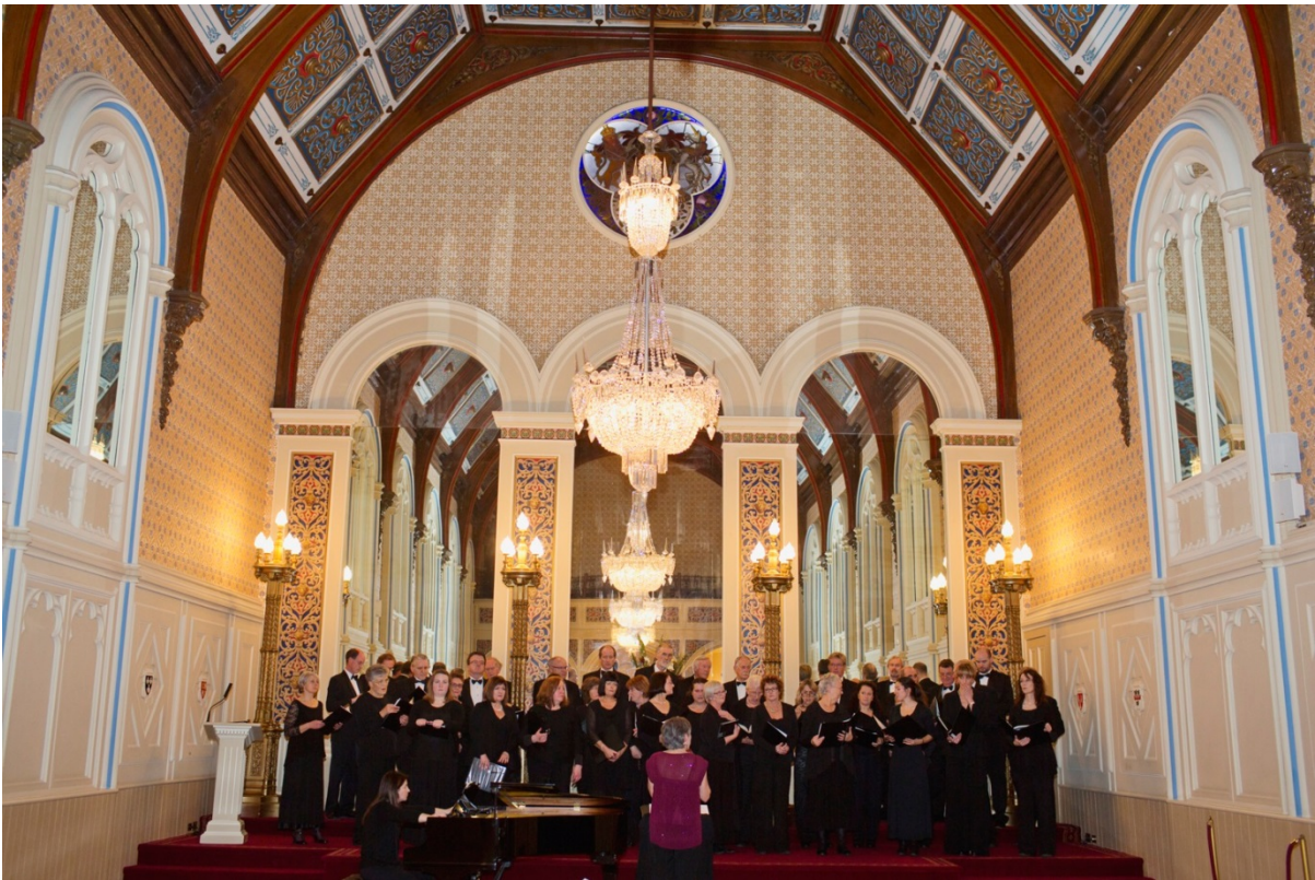
The TSO Chorus performs regularly in the Ball Room at Government House