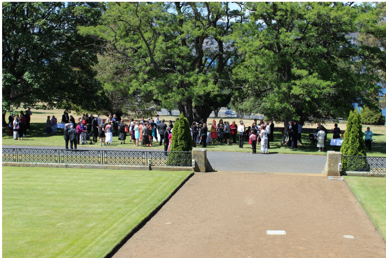
Cystic Fibrosis Tasmania Garden Tea, 7 December 2012

Events and functions hosted by the Governor and Mrs Underwood brought some 14,400 visitors to Government House in 2012-2013. (This number fluctuates in alternate years, Open Day being held every second year in order to encourage maximum attendance.)