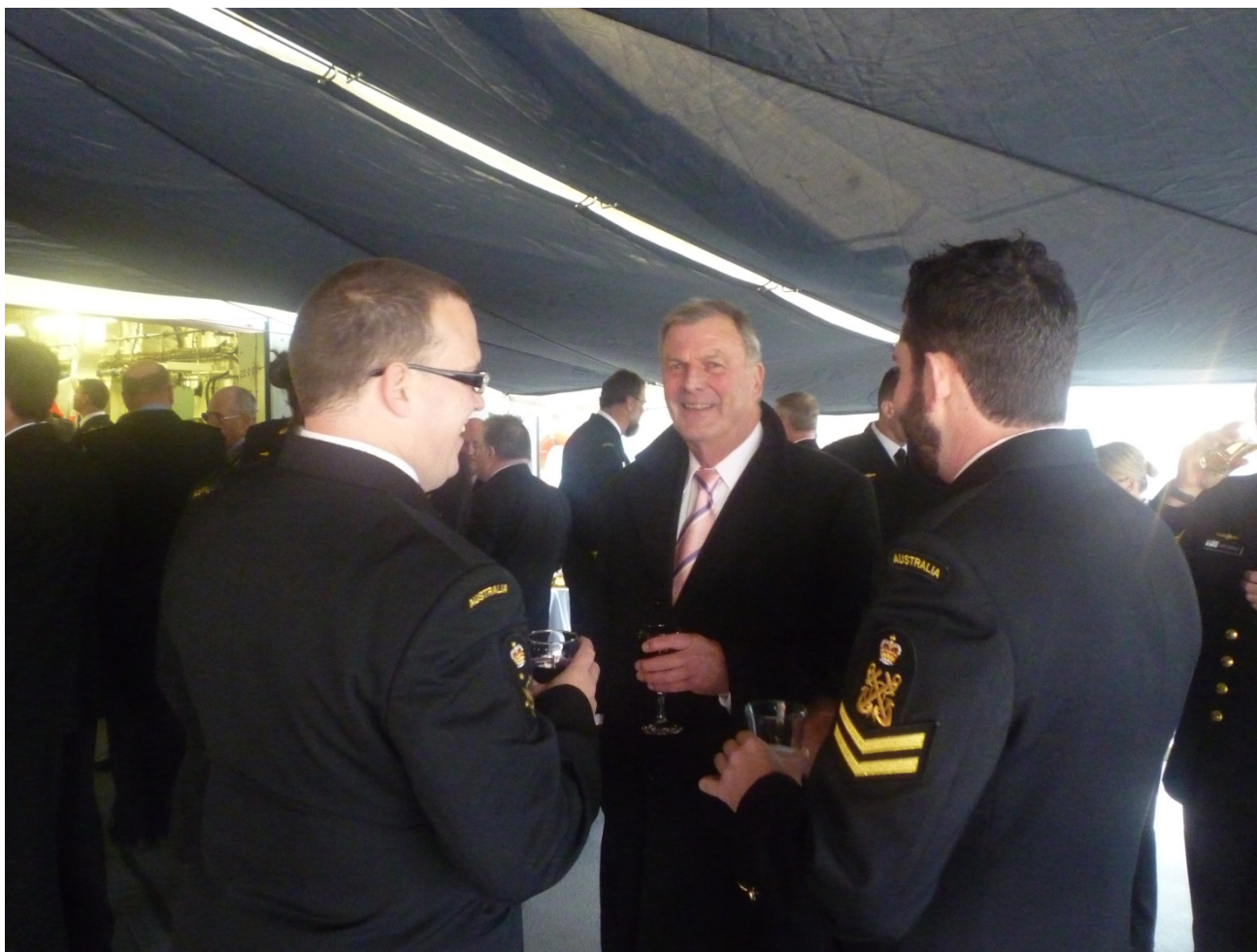
Official visiting Navy callers upon the Governor usually reciprocate with invitations to on-board functions. The Governor aboard HMAS Warramunga, 26 October 2012

The Governor received 90 official callers including heads of the Defence Forces, heads of Government Agencies, visiting overseas dignitaries, commanders of visiting Naval vessels, representatives of community organisations including those with Vice-Regal patronage and representatives from the fields of commerce, education, journalism and science and industry.