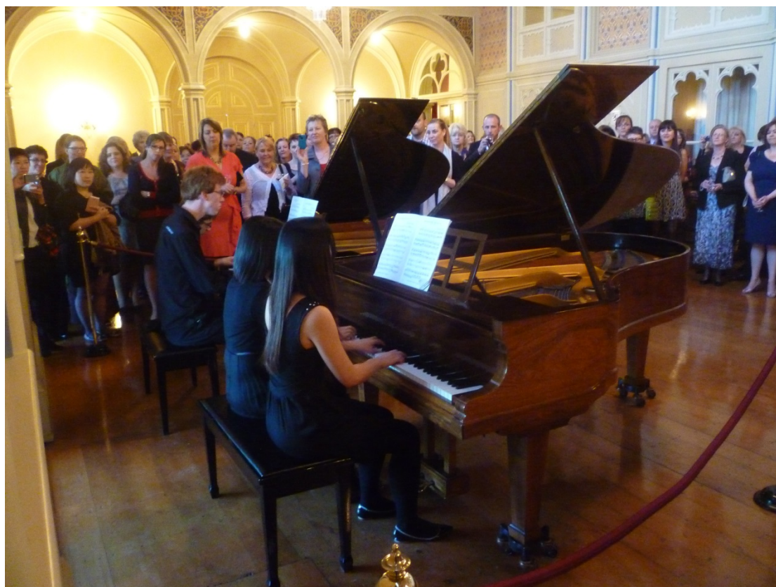
Reception for the 10 th International Conference for Emergency Nurses, 11 October 2012

Others: 12th/40th Battalion RTR 25th Anniversary; Australian 49ers; Australian Olympic Medallists; Australian Real Tennis Open Championships; Australian Wooden Boat Festival & Hobart Cup; Beacon Foundation; Country Women's Association of Australia; Defence Reserves Support Council; GASP! Project; Hobart Baroque; Hobart Chamber Orchestra; Hobart City Mission; Ogilvie High School Old Boys; Old Hobartian Association; Opus House project; Order of the Eastern Star; Queen's Birthday; Red Cross; Royal Automobile Club of Tasmania; Royal Flying Doctor Service; Royal Hobart Show; Wine Show Judges; Royal Life Saving Society; St George's Anglican Church; Salamanca Rotary Club; Sustainable Living Tasmania; Ten Days on the Island.