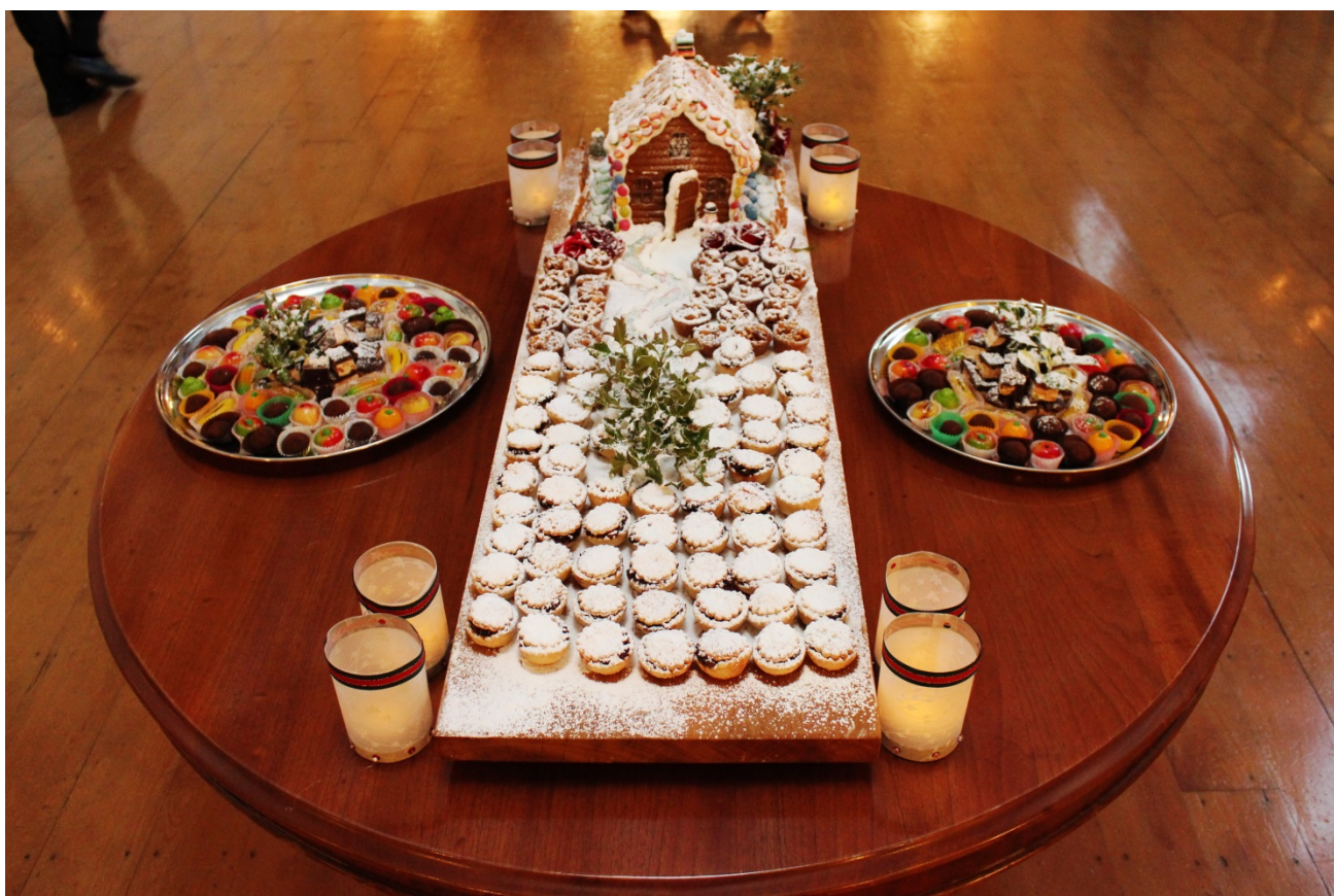
Fine fare from the Government House kitchen

The many functions at Government House provide a showcase for promoting Tasmanian food and beverages. All food served is produced in the Government House kitchen and is of a consistently high standard. Wherever possible Tasmanian produce is used, much of it grown on the Estate, and Tasmanian wines, beers and spirits are served.