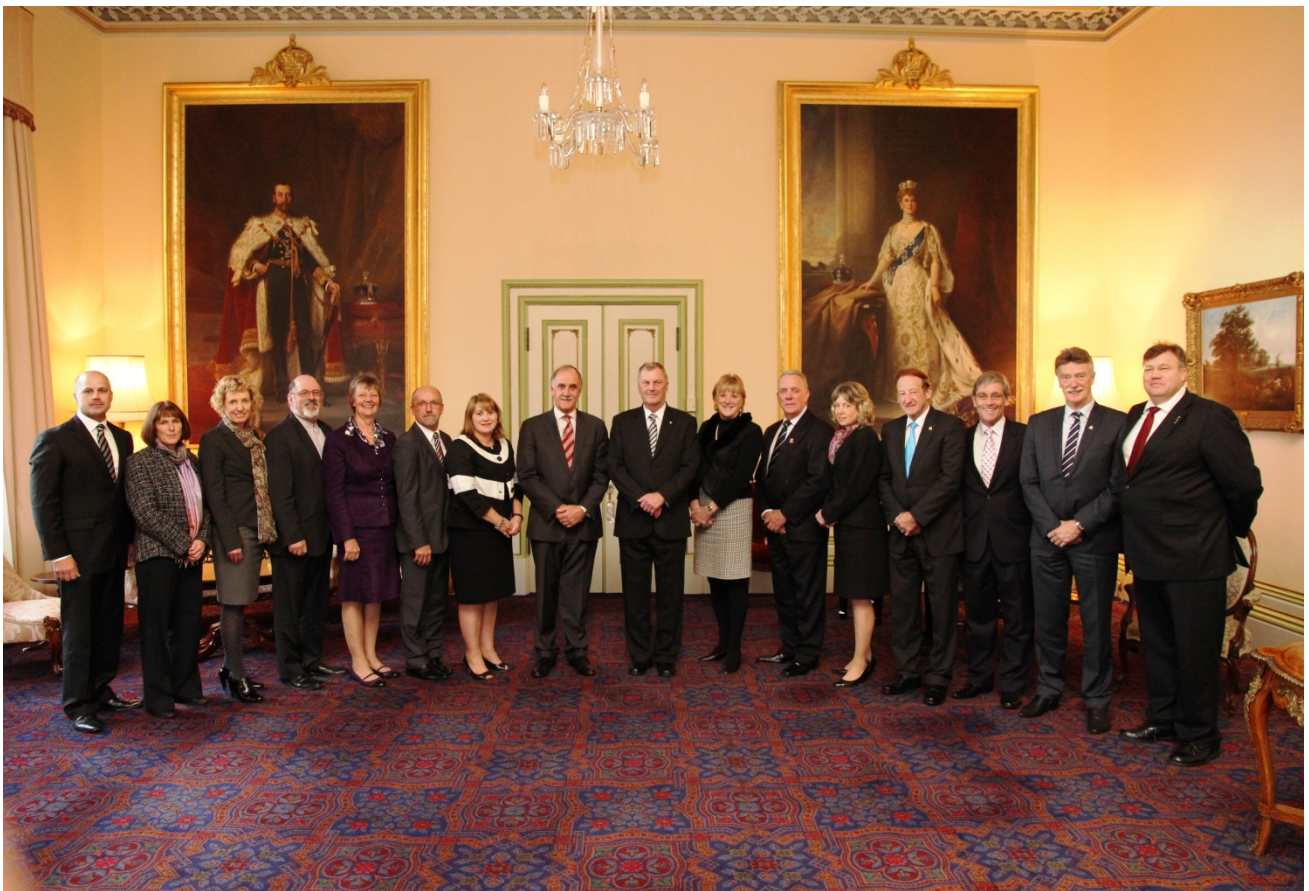
The Governor and members of the Legislative Council of the Parliament of Tasmania, May 2013