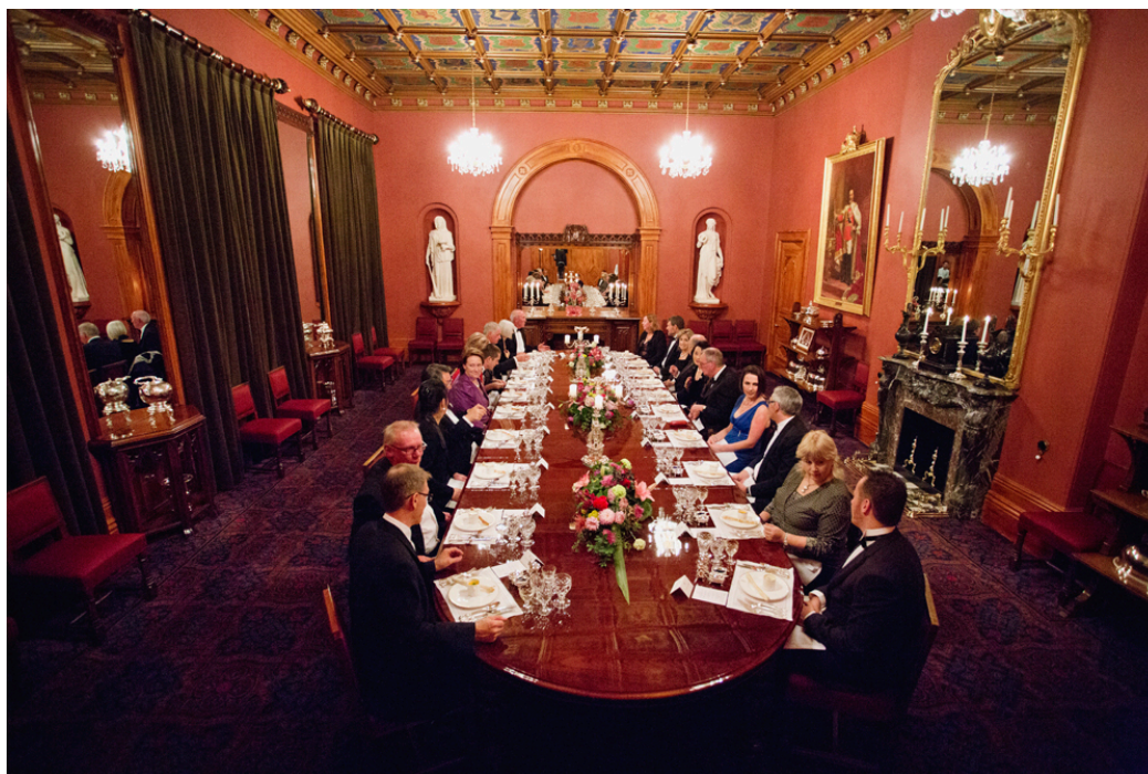
The Dining Room is regularly used for Luncheons and Dinners, seating a maximum of 34 guests

which provide for these events. In addition, accommodation suites are always kept available for visiting heads of state, ambassadors and other official visitors to Tasmania to stay at Government House.