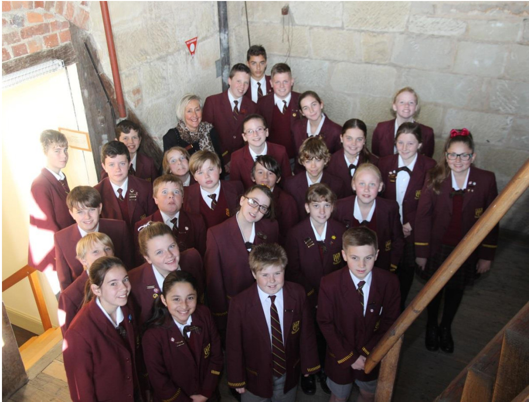
Dominic College students in the Clock Tower, 6 November 2013