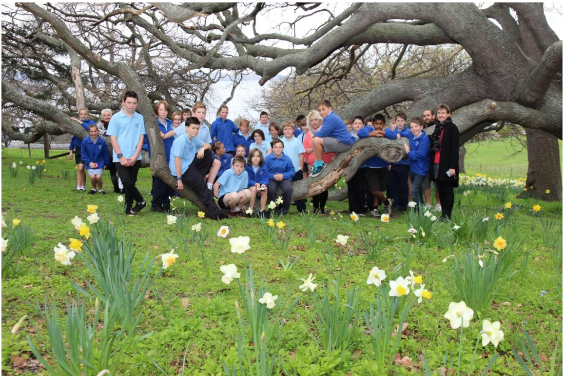
Bridport Primary School visit, 4 September 2013