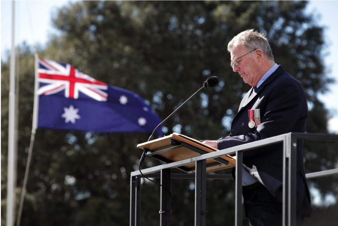
At the Battle of Britain Commemorative Service, 8 September 2013

Cressy District High School 150 th Anniversary Fair; International Wall of Friendship plaque dedications; University of Tasmania Summer School workshops; Cygnet Town Hall Centenary; Longford 200 th Anniversary; Cricket Tasmania luncheon; National Trust Heritage Festival; Hobart Photographic Society; Museums Australia; Chancellor's Lecture.