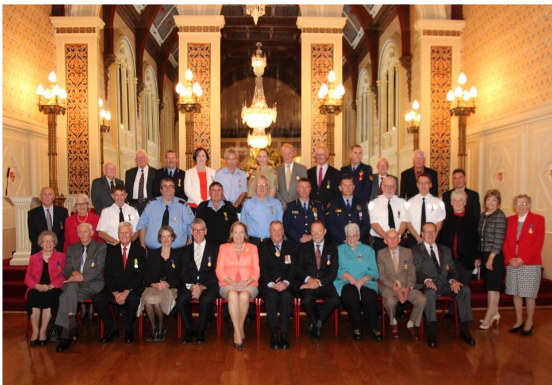
Australia Day Investiture, 23 May 2014