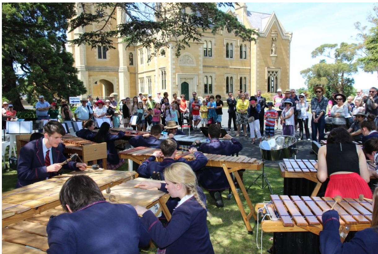
The Friend's School Marimba group, Open Day 1 December 2013