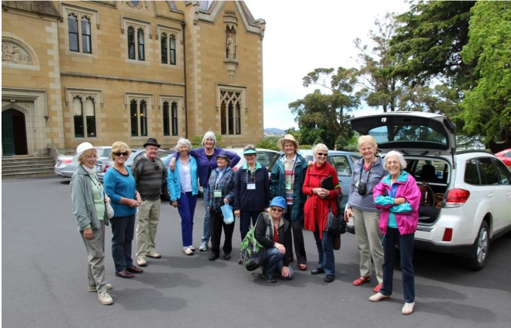
Clarence U3A Painting Group, November 2013

During the year 47 school and community groups visited Government House to view the House and grounds and to learn more about the many and varied roles of the Office.