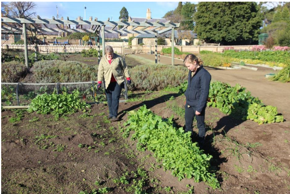
Two of our VET students tend the vegie patch as part of their Horticulture Certificate II course