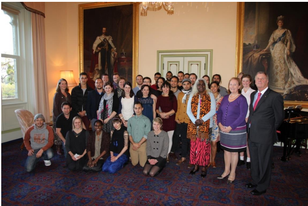
Bangarra Dance Group, 10 September 2013