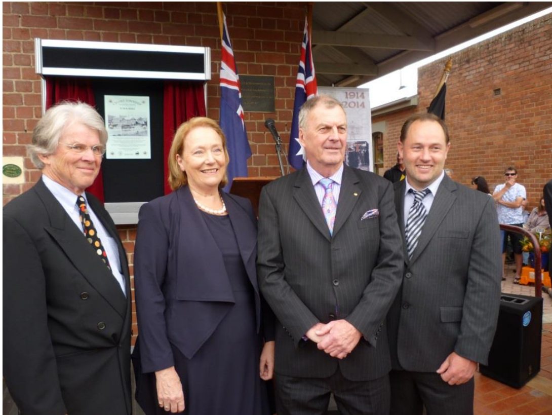
The Cygnet Town Hall Centenary Commemoration, 19 January 2014