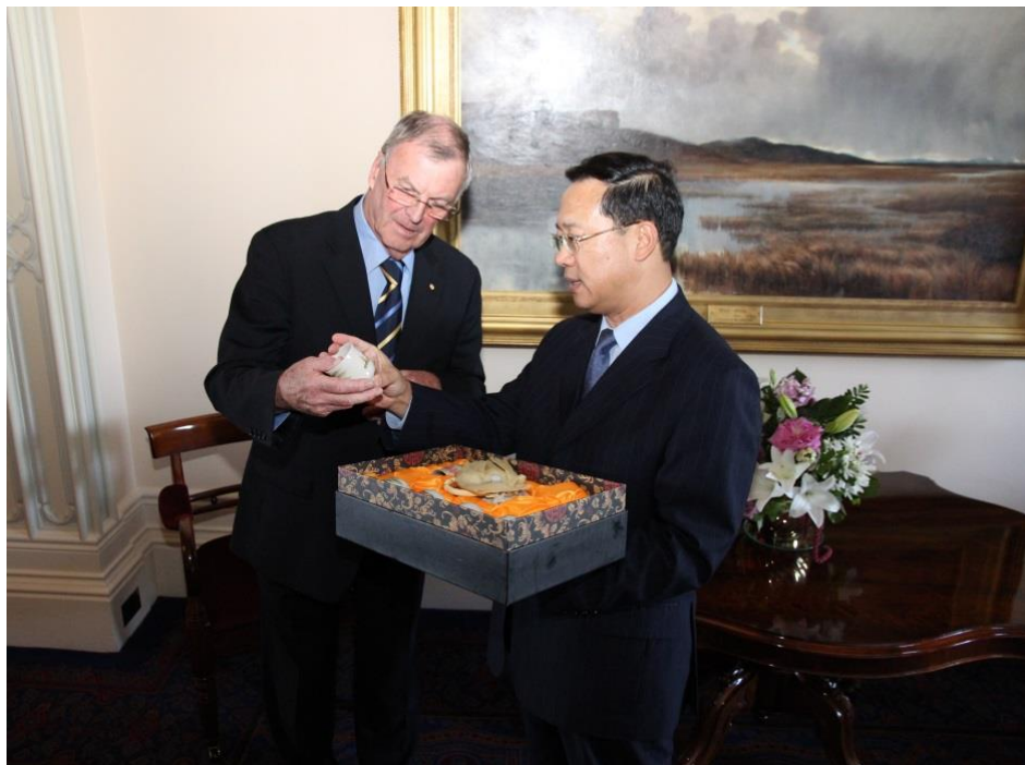
The Chinese Ambassador Mr Ma Zhaoxu, 11 February 2014