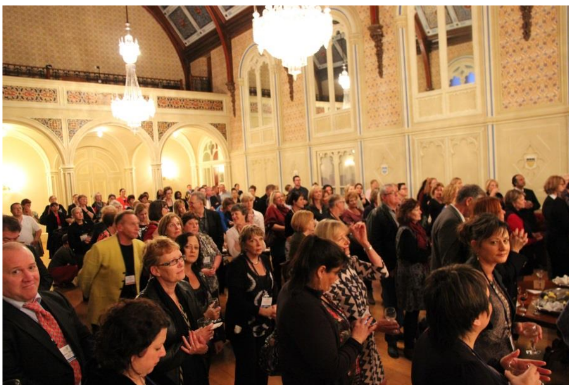
College of Nurse Practitioners Conference reception, 24 September 2013