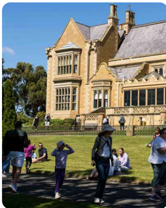
Guests visiting Government House for Open Day, November 2024