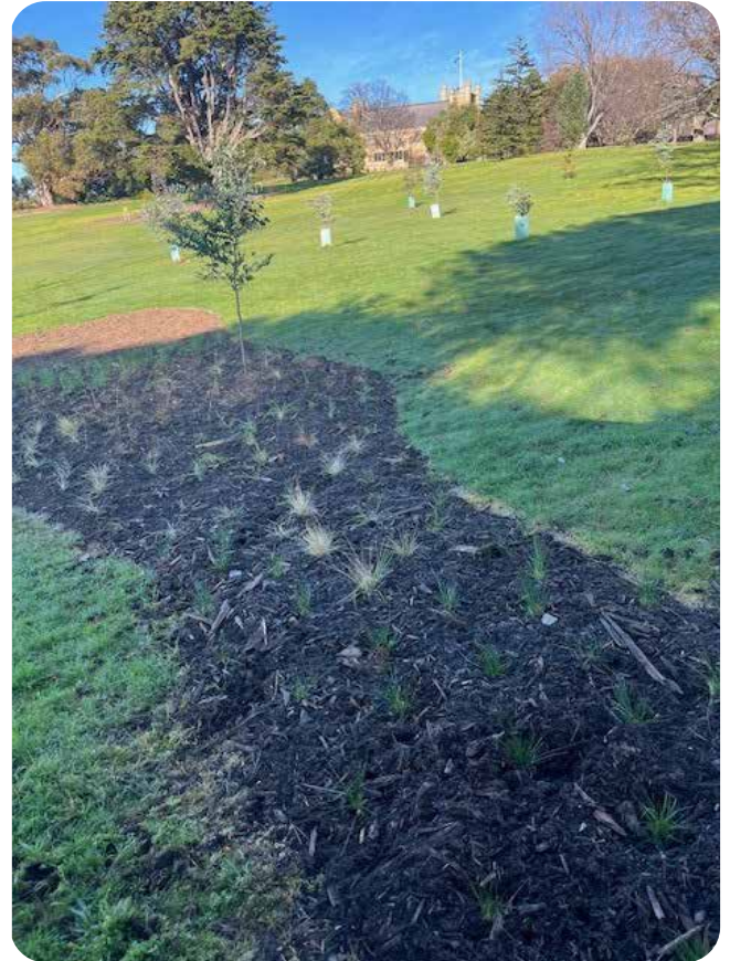
New native grass plantings under the Eucalyptus Morrisbyi in the Eastern Arboretum

Other projects included planting out a new native grass planting under the Eucalyptus Morrisbyi , with 1200 grasses planted and the planting of up to 1000 more each year planned. Due to space restrictions in the Vineyard Paddock, a new location was planned for a new Premier's Oak Grove on the Wattle Lawn. Here trees will be planted to commemorate Tasmanian Premiers,