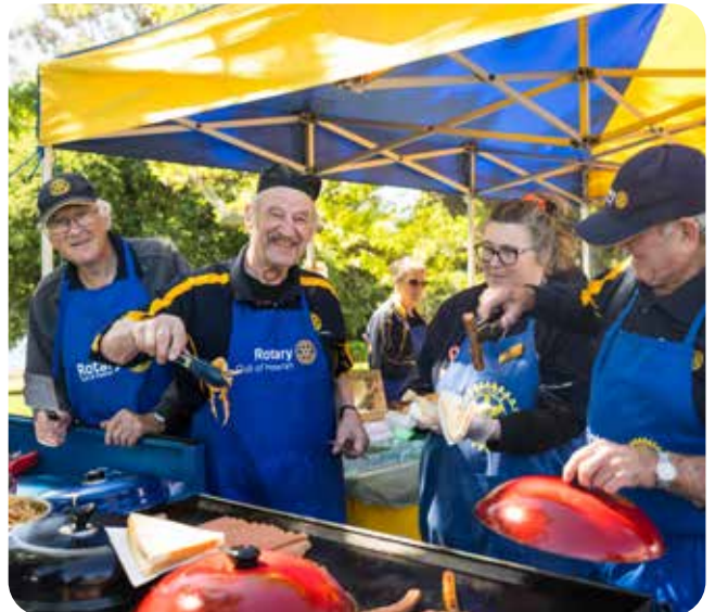
Members of the Rotary Club of Howrah staffing the barbecue at Open Day, November 2024