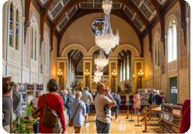
Guests view displays in the Government House Ballroom during Open Day, November 2024

Despite some challenging windy weather, several of Her Excellency's Patronage organisations were able to join in on the day with stalls in the Government House grounds. Entertainment was provided by the Australian Army Band, the Royal Australian Navy Band, the Tasmania Police Pipe Band and the Hobart Highland Dancers.