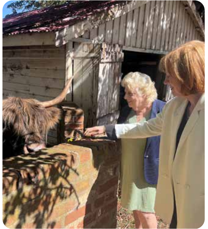
Her Excellency meets a highland cow during a Municipal Visit to the Central Highlands, March 2025