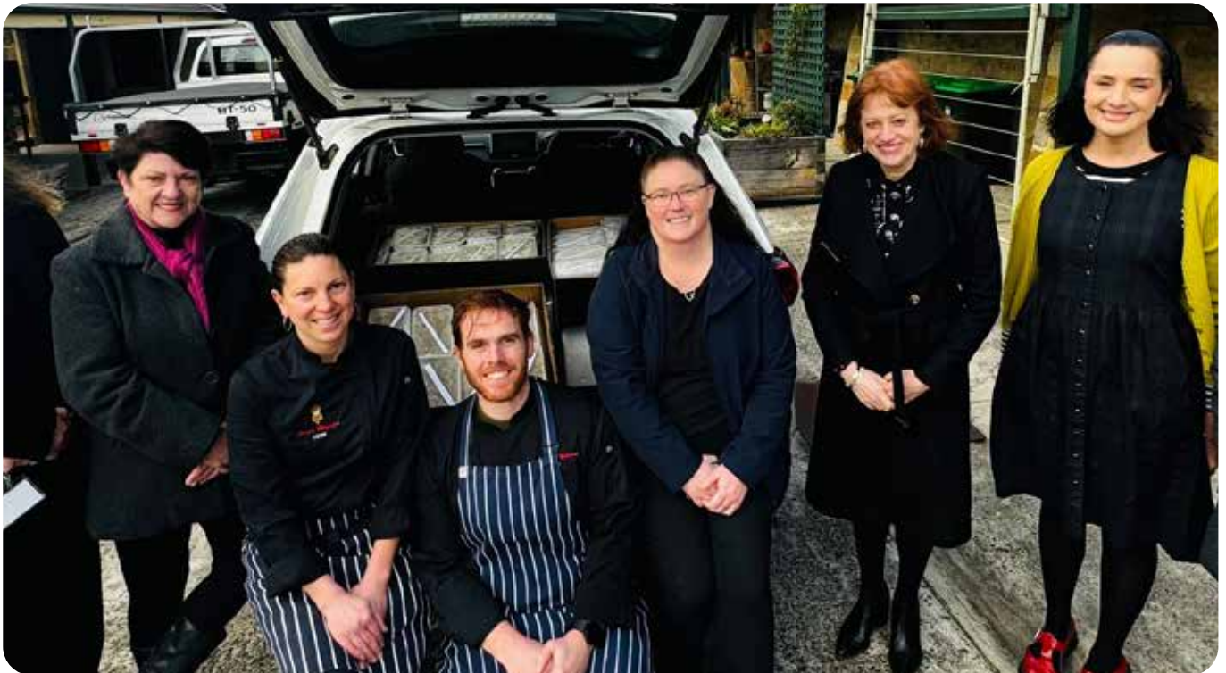
Her Excellency with Kitchen staff and charity representatives during Homelessness Week, August 2024