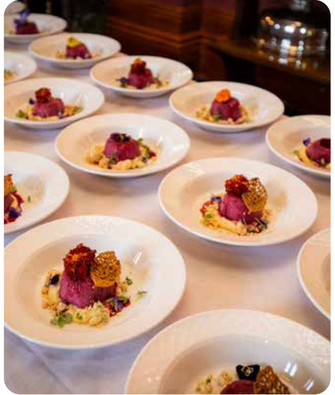
Dessert served at the International Women's Day luncheon, March 2025

The Governor offers accommodation and hospitality for a number of Ambassadors or High Commissioners who make an official visit to Tasmania each year, during which a formal dinner is hosted at Government House in honour of the visiting dignitary. These dinners are an opportunity to showcase Tasmanian produce from our local producers along with fresh produce from the Government House gardens. The wines served at the dinners and at all early evening reception events are produced from the grapes which are grown in the Government House Vineyard. In the year under review, the Kitchen catered for dinners for the Ambassadors of the European Union, Finland, Belgium, Indonesia and the United Arab Emirates, and the High Commissioners for Singapore and India, in addition to formal dinners for other groups.