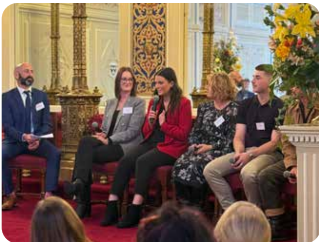
Panel of educators, students and employers at the King's Birthday luncheon, June 2025

On 13 June 2025, Her Excellency hosted a fundraising luncheon to support her Patronage organisation the Beacon Foundation. The event was held to mark His Majesty the King's Birthday in Tasmania. Guests heard from young people, educators and employers involved in Beacon's programs, and enjoyed musical performances by the Tasmanian Youth Orchestra and students from Rosny College's musical theatre production Newsies . Students from Rosny College undertook work experience at Government House during the week of the event, working with housekeeping and kitchen staff and the Government House florist. Placement students also assisted with service during the event. All proceeds from the event went to support Beacon's programs in local schools, which help to guide students along their career journeys.