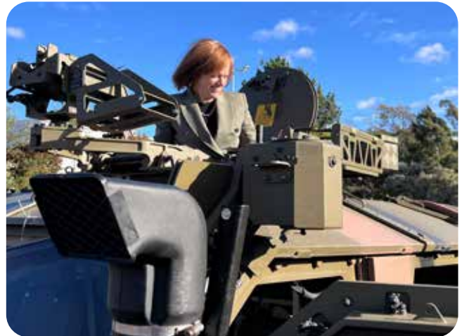
Her Excellency visits the Youngtown Barracks in Launceston, April 2025