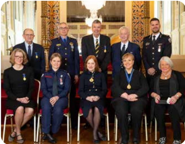
Her Excellency and recipients of Australian Honours and Awards, September 2024