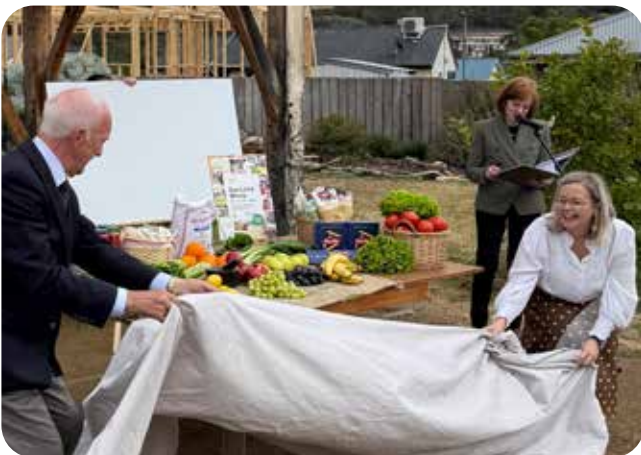
Her Excellency joins COTA Tasmania to launch the theme of Senior's Week 2025 in Warrane, April 2025