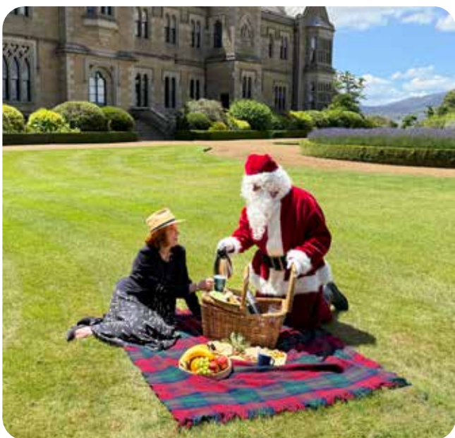
Her Excellency and Santa enjoying a picnic on the Government House lawns, December 2024