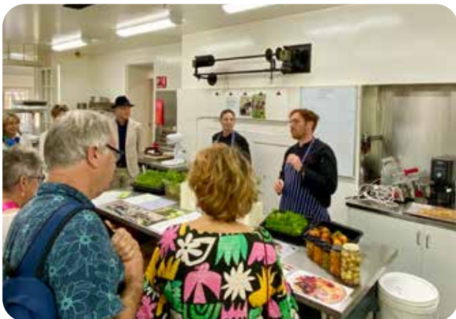
Kitchen staff presenting during a Behind the Scenes tour at Government House, November 2024