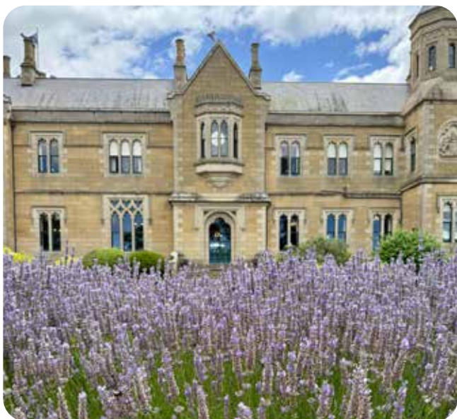
Lavender blooming in the Government House gardens, January 2025

A significant effort was undertaken to establish and formalise the Office's IT governance framework. A comprehensive suite of policies, standards, and guidelines was developed to address longstanding gaps and provide a clear foundation for secure and effective IT operations. These governance documents are designed to support accountability, manage risk, and align the Office's technology environment with recognised best practices.