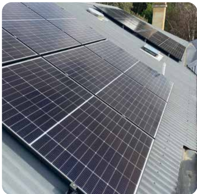
The new roof top solar system installed at Rosssbank, August 2024