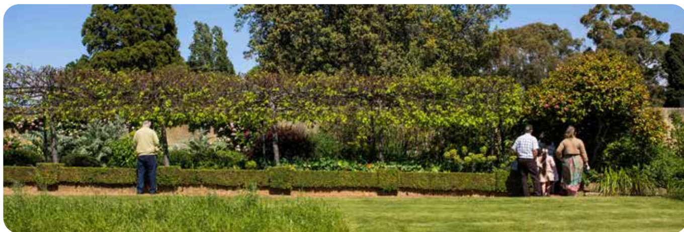
Guests exploring the Government House gardens during Open Day, November 2024