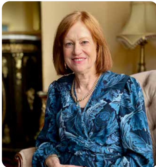
Her Excellency the Honourable Barbara Baker AC, Governor of Tasmania, January 2025

In November 2024, Government House hosted its biennial Open Day, incorporating tours, performances and activities provided by Her Excellency's Patronage organisations. An estimated 6,000 visitors attended the event.