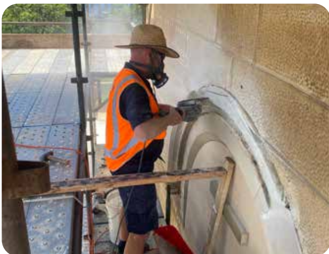
Sandstone works being undertaken on the northern wall of the Government House Ballroom