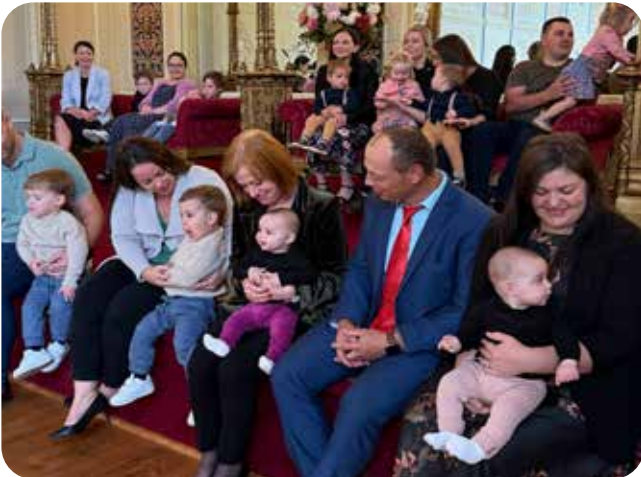
Her Excellency hosts a morning tea for the Tasmanian Multiple Births Association, May 2025