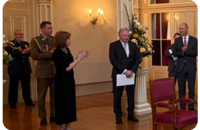
Aide-de-Camp and Honourary Aide-de-Camp supporting the swearing-in of the Lieutenant Governor, January 2025

The Office of the Governor benefits from outstanding service provided in a variety of roles to Her Excellency by her Honorary Aides-de-Camp. Honorary ADCs are drawn from the Royal Australian Navy, Australian Army, the Royal Australian Air Force and Tasmania Police. Honorary ADCs provide, at no charge to the Office of the Governor, assistance at all major functions at Government House and they attend the Governor at numerous external events, particularly during weekends. In their work, they exemplify the high standards, knowledge and attention to detail that Tasmanians and visitors to Tasmania appreciate in the Office of the Governor.