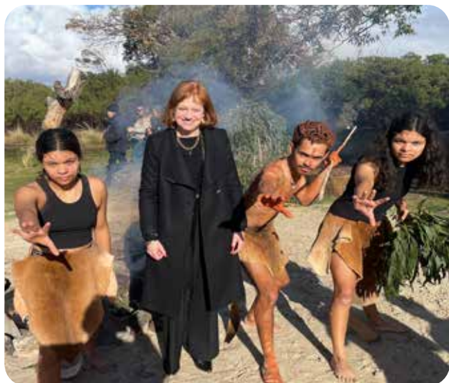
Her Excellency at NAIDOC Week celebrations in Devonport, July 2024