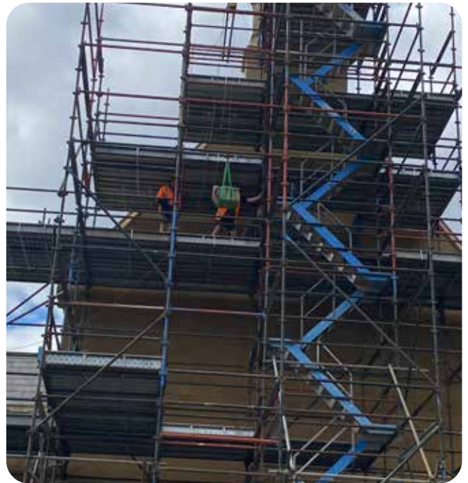
Scaffolding on the northern wall of the Government House Ballroom to facilitate sandstone works

During the year, sandstone repair and replacement was undertaken on the northern exterior wall of the Government House ballroom. This work was identified in a Government House report dated June 2023. The cost of this work, approximately $100,000, was met through funds raised as authorised by the Government House Land Act 1964 .