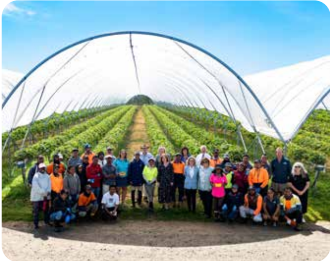
Her Excellency visits the Mountford Berry Farm during a Municipal Visit to the Northern Midlands, February 2025