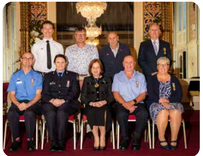
Her Excellency and recipients of Australian Honours and Awards, May 2025