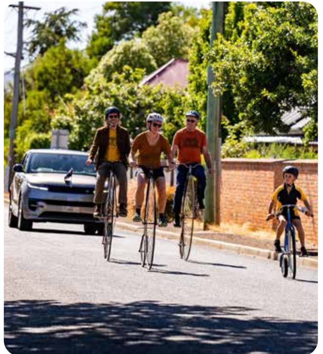
The Vice-Regal vehicle escorted through Evandale by penny farthings during a Municipal Visit to the Northern Midlands, February 2025