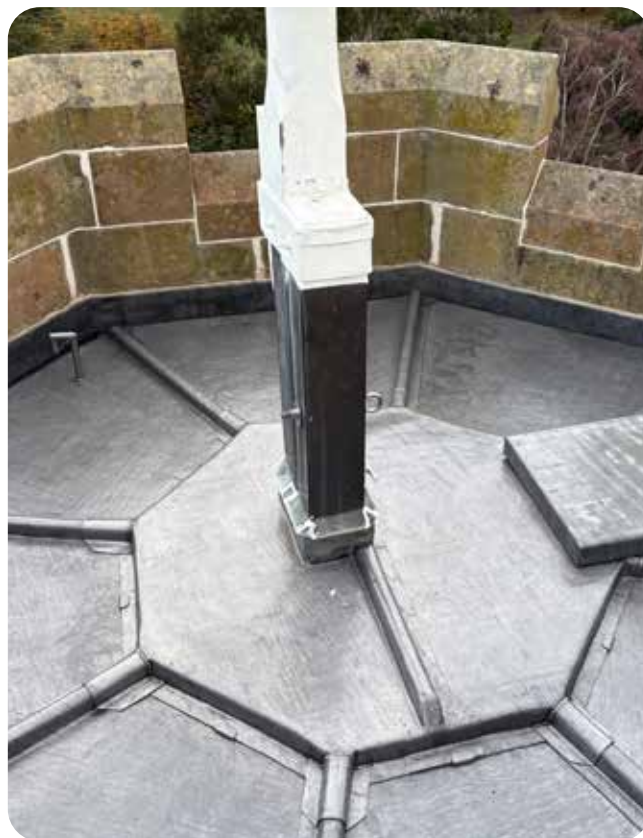
The new lead roof of the Police Tower at Government House