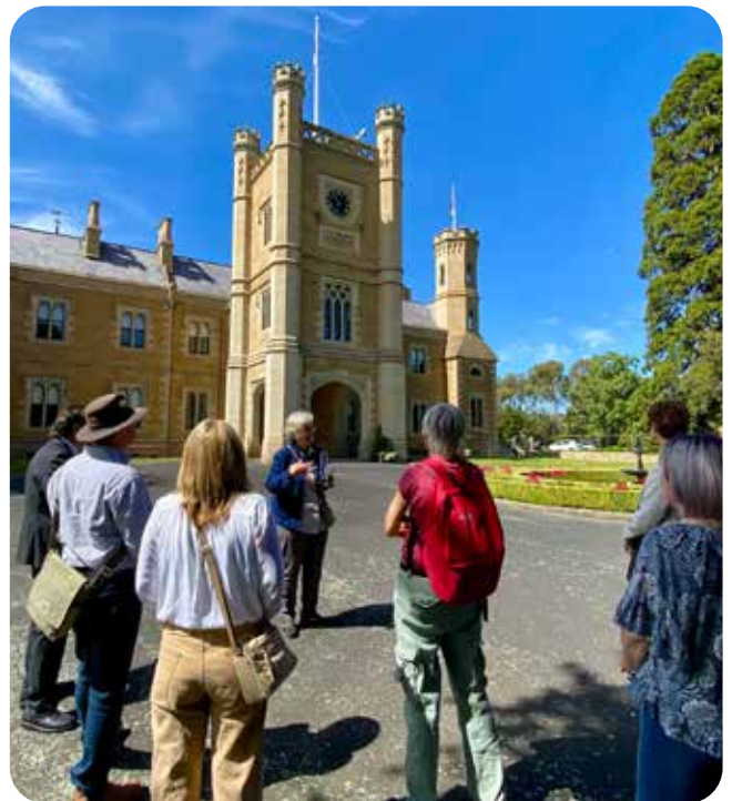
Visitors take part in a tour at Government House, November 2024

Revenue from the tours, lecture program and Gift Shop is directed towards the heritage maintenance and preservation of the Government House Estate.