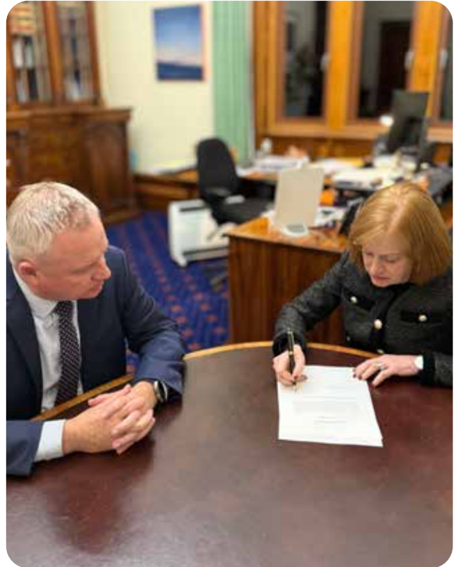
Her Excellency signs Proclamations to prorogue Parliament and dissolve the House of Assembly, following a request for a general election from Premier Jeremy Rockliff MP, June 2025

In addition, the Governor exercises executive power, but (with rare exceptions) only on the advice of Ministers who are responsible to the Parliament. That advice is generally conveyed through the Executive Council. The Governor presides at regular meetings of the Council, giving the constitutionally required approval to give legal effect to many Government decisions. During 2024–2025, the Governor and Lieutenant Governor (when administering) presided over 24 Executive Council meetings.