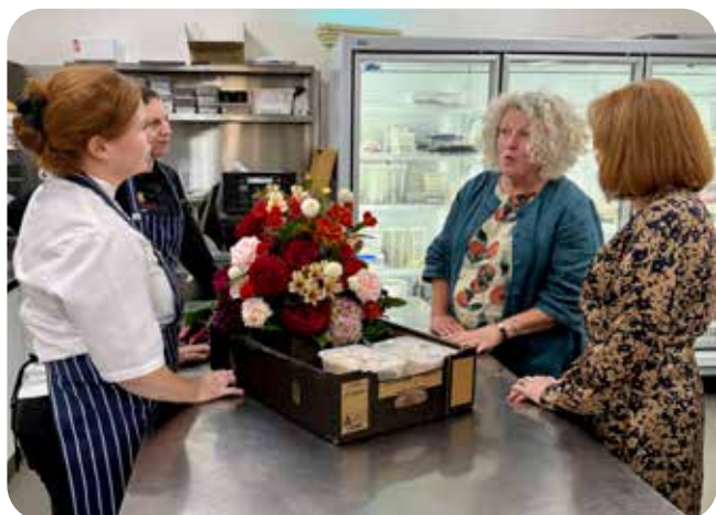
Her Excellency and Kitchen staff presenting a donation to the Sexual Assault Support Service, March 2025