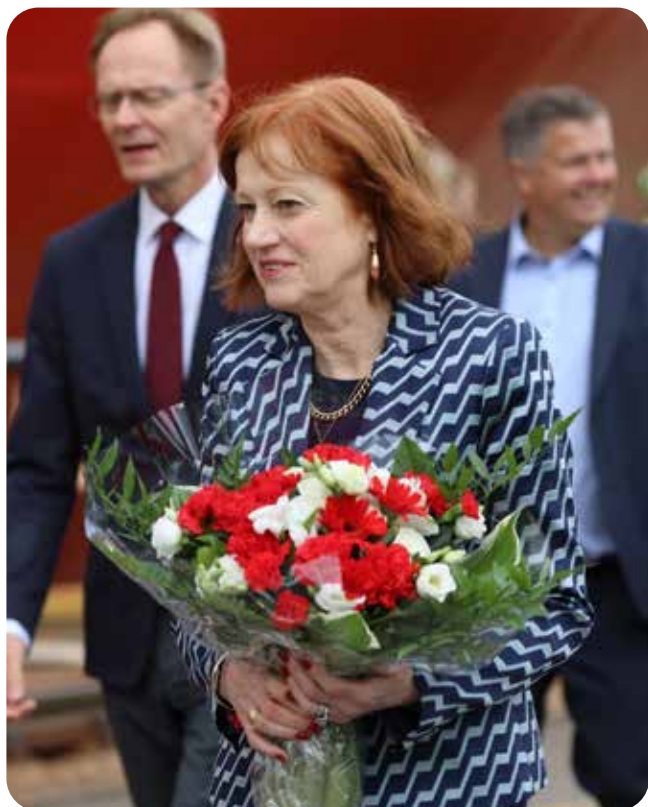
Her Excellency at the launch of Spirit Tasmania V in Rauma, Finland, July 2024