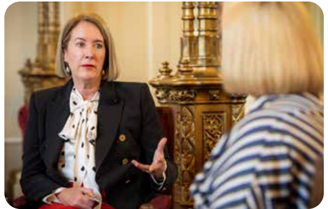
Guest speaker Elizabeth Broderick AO at the International Women's Day luncheon, March 2025

On 13 June 2025, Her Excellency hosted a fundraising luncheon to support her Patronage organisation the Beacon Foundation. The event was held to mark His Majesty the King's Birthday in Tasmania. Guests heard from young people, educators and employers involved in Beacon's programs, and enjoyed musical performances by the Tasmanian Youth Orchestra and students from Rosny College's musical theatre production Newsies . Students from Rosny College undertook work experience at Government House during the week of the event, working with housekeeping and kitchen staff and the Government House florist. Placement students also assisted with service during the event. All proceeds from the event went to support Beacon's programs in local schools, which help to guide students along their career journeys.