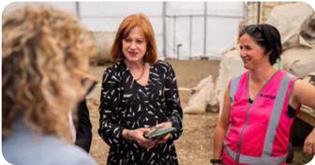
Her Excellency visits X Hemp at Cressy during a Municipal Visit to the Northern Midlands, February 2025