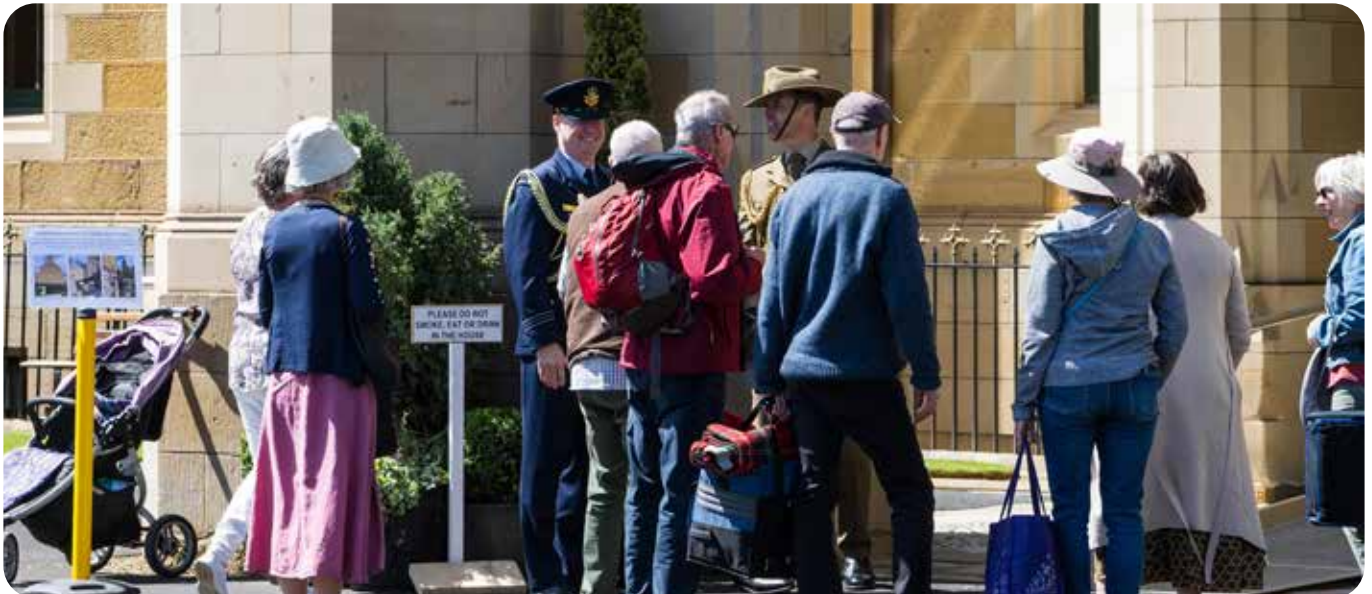
Honourary Aides-de-Camp greeting visitors to Government House during Open Day, November 2024