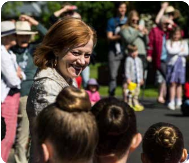
Her Excellency speaking to young performers during Open Day, November 2024