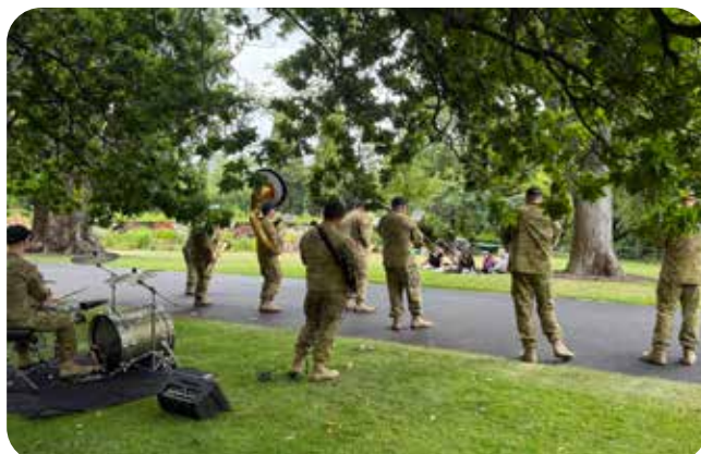
The Australian Army Band Tasmania performing at Lunch on the Lawns, January 2025