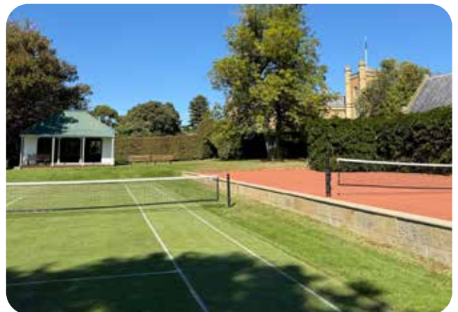
Government House tennis courts and pavilion, March 2025