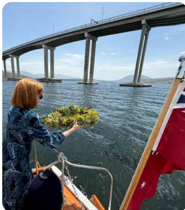
Her Excellency lays a wreath to commemorate the 50th anniversary of the Tasman Bridge disaster, January 2025