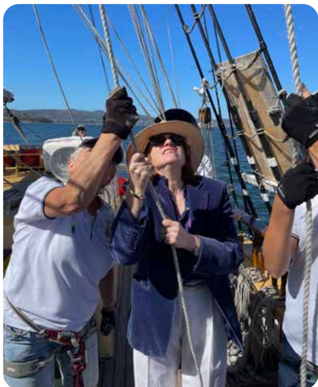
Her Excellency is shown the ropes during an International Women's Day sail on the Lady Nelson, March 2025