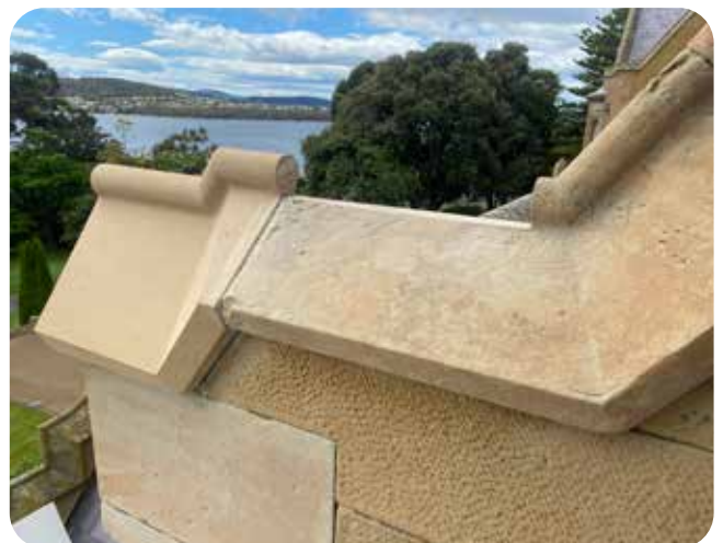
The completed sandstone works on the northern wall of the Government House ballroom