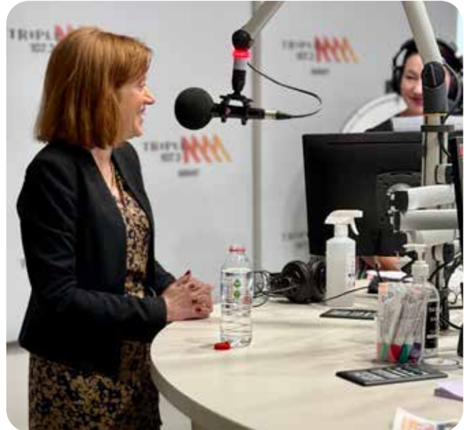
Her Excellency discussing International Women's Day with Triple M's Kaz and Tubes, March 2025

The website is a valuable tool for increasing awareness of the role and activities of the Office. The website also enables invited guests and members of the public to reserve their online tickets to attend the many events hosted at Government House, including morning and afternoon teas, lectures, receptions, award presentations and tours.