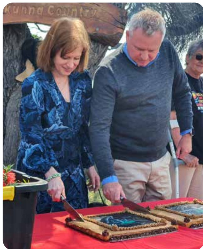
Her Excellency and Premier Jeremy Rockliff MP at the Mannalargenna Day Festival, December 2024