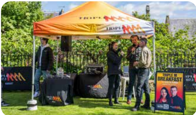
Triple M's Kaz and Tubes conducting a live broadcast during Open Day, November 2024

Hobart radio station Triple M conducted a live broadcast and interviewed Her Excellency and Government House staff.