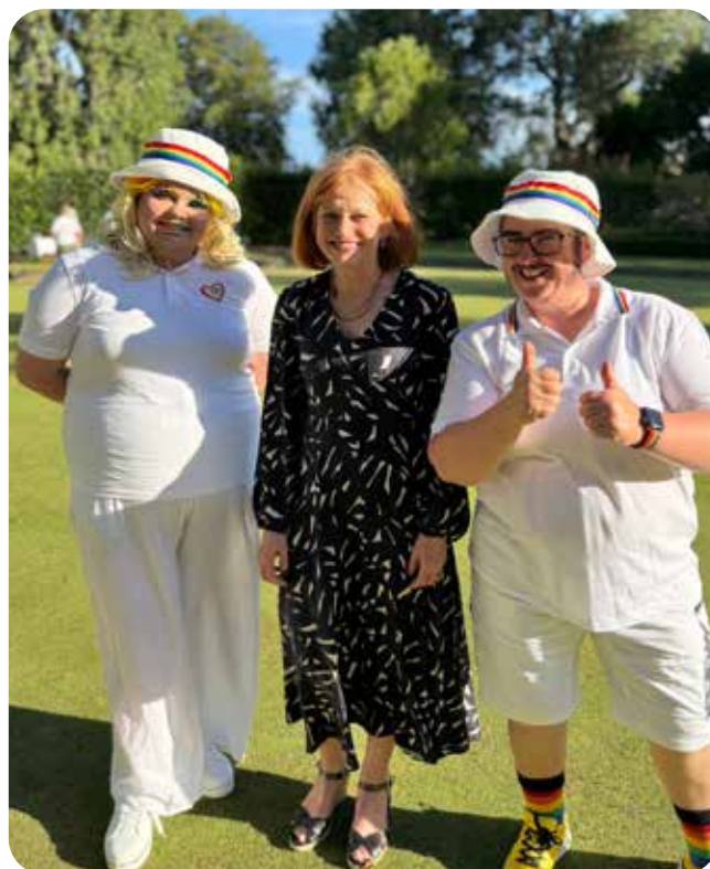
Her Excellency celebrates TasPride with the LGBTQIA+ community on the bowling green, February 2025