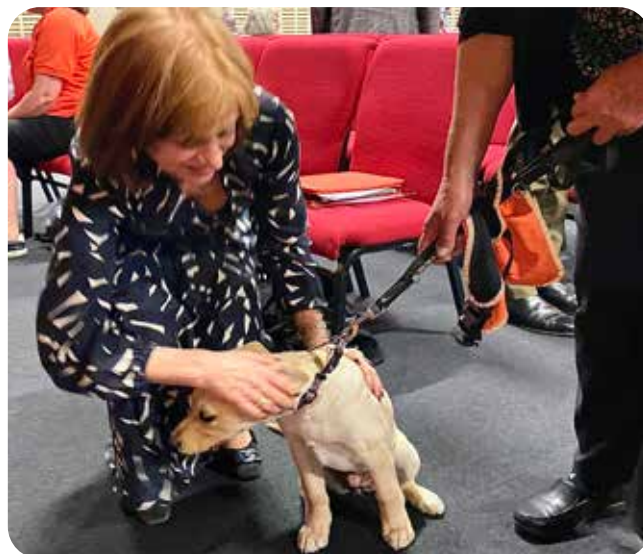
Her Excellency meets a puppy in training at the Guide Dogs Tasmania graduation in Hobart, November 2024