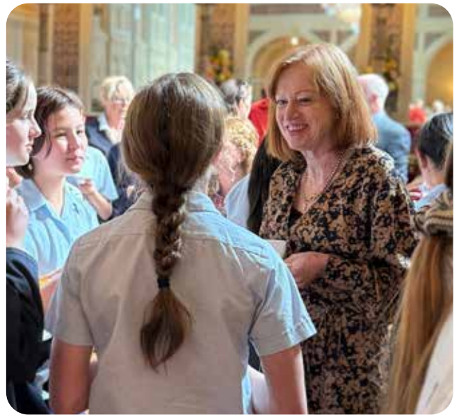
Her Excellency talking to students from The Friends School, March 2025