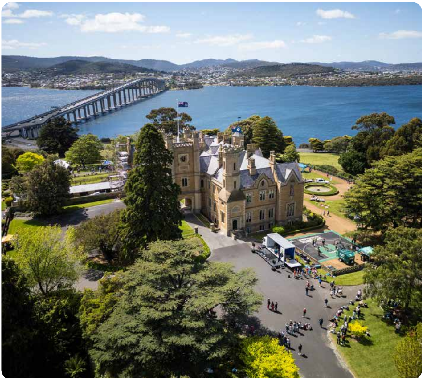
An aerial view of visitors attending Open Day at Government House, November 2024