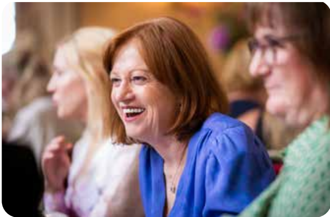
Her Excellency at the International Women's Day luncheon, March 2025

During the year under review, Her Excellency hosted two fundraising luncheons to support Tasmanian organisations. On 7 March 2025, she hosted an International Women's Day luncheon at Government House. More than 100 guests attended and a total of $20,300 was raised for the Hobart Women's Shelter through ticket sales and donations on the day. The event featured guest speaker Elizabeth Broderick AO, former Australian Sex Discrimination Commissioner and UN Special Rapporteur for Discrimination Against Women and Girls. Connected with the International Women's Day theme for 2025, "March Forward – For ALL Women and Girls", she discussed the major challenges that still need to be addressed to support women and girls in Australia and around the world.